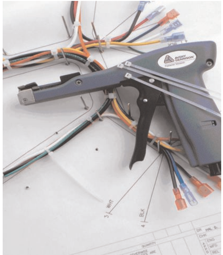
High-Temperature Cable Tie