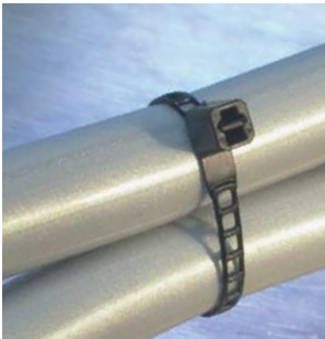
Lawn & Garden