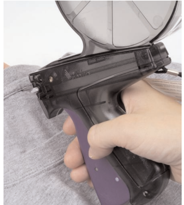
System 1000® II Hand Tool

The System 1000 II will also attach your company name, brand, feature, size, etc. with our Brand Identification fasteners. These fasteners can be printed on the front, back, or both and are available in virtually any color.